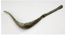
Title: Strigil Date: about 500–300 BCE Primary Maker: Graeco-Roman Medium: bronze