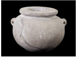
Title: Cosmetic Vessel Date: Middle Kingdom, about 1980–1760 BCE Primary Maker: Ancient Egyptian Medium: anhydrite