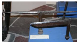
Title: Narrow T-Shaped Stake Anvil Date: 1600s–1700s Primary Maker: Spanish Medium: steel