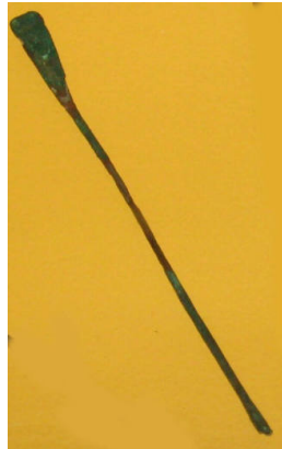
Title: Surgical Spatula Probe Date: 1st–3rd century Primary Maker: Roman Medium: bronze