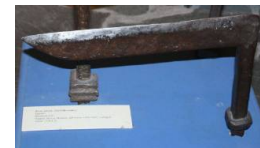
Title: L-Shaped Anvil Stake Date: 1700s–1800s Primary Maker: Spanish Medium: steel