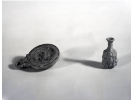
Title: Lamp Date: 1st century CE Primary Maker: Greek Medium: terracotta