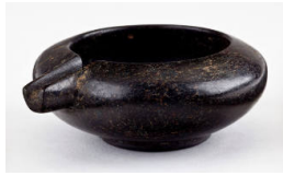
Title: Bowl with Spout Date: Middle Kingdom, about 1980–1760 BCE Primary Maker: Ancient Egyptian Medium: stone