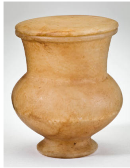
Title: Piriform Vase Date: New Kingdom, about 1539–1077 BCE Primary Maker: Ancient Egyptian Medium: alabaster