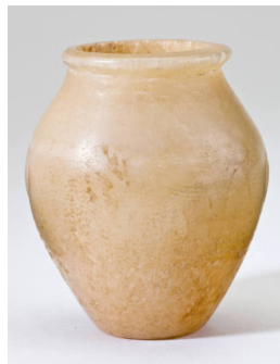
Title: Cosmetic Vessel with Feet Date: about 2030–1650 BCE, Middle Kingdom Primary Maker: Ancient Egyptian Medium: alabaster