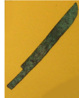
Title: Surgical Scalpel Date: 1st–3rd century Primary Maker: Roman Medium: bronze