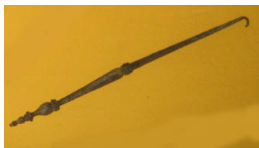
Title: Surgical Retractor Date: 1st–3rd century Primary Maker: Roman Medium: bronze