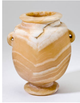
Title: Jar Date: n.d. Primary Maker: Ancient Egyptian Medium: alabaster