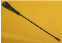
Title: Surgical Spatula Probe Date: 1st–2nd century Primary Maker: Roman Medium: bronze