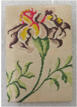
Title: Card case Date: early 1800s Primary Maker: European Medium: silk brocade, white with large flower design