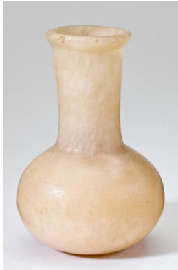
Title: Vase Date: 2650–2150 BCE Primary Maker: Ancient Egyptian Medium: alabaster