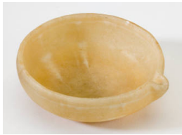
Title: Mortar Date: 22nd–20th century BCE Primary Maker: Ancient Egyptian Medium: alabaster