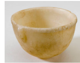
Title: Mortar Date: 22nd–20th century BCE Primary Maker: Ancient Egyptian Medium: alabaster