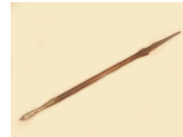
Title: Crossbow Bolt Date: late 1400s Primary Maker: European Medium: Steel and wood