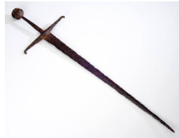
Title: Broadsword of the "Castillon" group Date: 1400–1450 Primary Maker: Western European Medium: steel with traces of organic materials from grip and scabbard