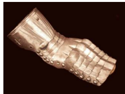
Title: Left Gauntlet Date: portions from 1500s Primary Maker: Western European Medium: steel and leather