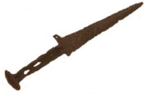
Title: Excavated "Baselard" Dagger Date: 1300s–1400s Primary Maker: European Medium: steel and iron