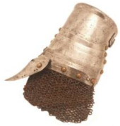
Title: Left Gauntlet Date: about 1510 Primary Maker: European Medium: steel, iron and brass with leather