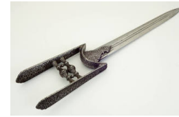
Title: Katar (punch dagger) Date: late 1700s Primary Maker: Southern Indian Medium: steel and iron with silver