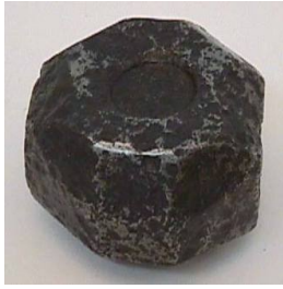
Title: Sword Pommel Date: 1300s–1400s Primary Maker: European Medium: iron