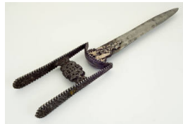
Title: Jamadhar (punch dagger) Date: 1600s Primary Maker: Southern Indian Medium: steel, iron, silver, brass and copper