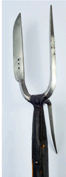
Title: Military Fork Date: mid 1500s Primary Maker: European Medium: steel and wood with paint