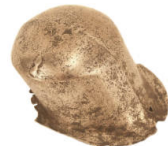
Title: Codpiece Date: 1500–1550 Primary Maker: Central European Medium: steel