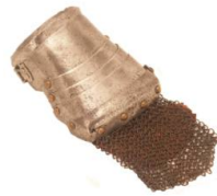
Title: Right Gauntlet Date: about 1510 Primary Maker: European Medium: steel, iron and brass with leather