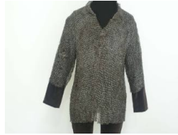
Title: Mail Shirt Date: probably 1400s Primary Maker: European Medium: iron