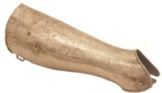
Title: Right Greave Date: about 1500 (rearplate modern) Primary Maker: European Medium: steel with modern leather