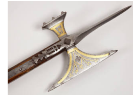
Title: Pollaxe Date: late 1400s Primary Maker: Northern European Medium: steel, brass, and ash wood