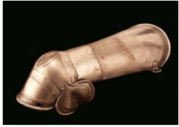
Title: Left Cuisse Date: 1500s with modern restorations Primary Maker: Western European Medium: steel and leather