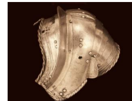
Title: Left Pauldron Date: mid to late 1500s, with modern restorations Primary Maker: Western European Medium: steel and leather