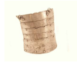
Title: Left Tasset Date: 1500s–1800s Primary Maker: European Medium: steel with modern leather