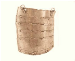
Title: Right Tasset Date: 1500s–1800s Primary Maker: European Medium: steel with modern leather