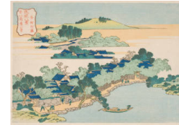
Title: Bamboo Grove at Kumemura (Kumemura chikuri) Date: about 1832 Primary Maker: Katsushika Hokusai Medium: woodblock print; ink and color on paper