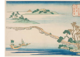
Title: Clear Autumn Sky at Chk (Chk shsei) Date: about 1832 Primary Maker: Katsushika Hokusai Medium: woodblock print; ink and color on paper