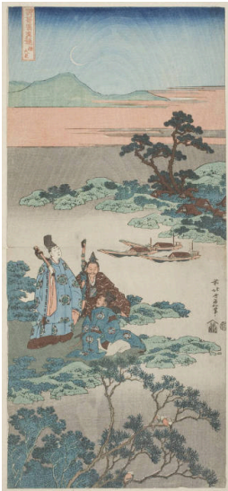
Title: Minister Tru (Tru daijin) Date: about 1833 Primary Maker: Katsushika Hokusai Medium: woodblock print; ink and color on paper