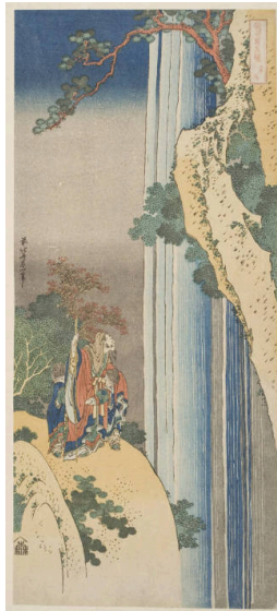
Title: Li Bai (Ri Haku) Date: about 1833 Primary Maker: Katsushika Hokusai Medium: woodblock print; ink and color on paper