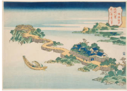
Title: The Sound of the Lake at Rinkai (Rinkai kosei) Date: about 1832 Primary Maker: Katsushika Hokusai Medium: woodblock print; ink and color on paper