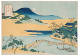
Title: Evening Moon at Izumizaki (Izumizaki yagetsu) Date: about 1832 Primary Maker: Katsushika Hokusai Medium: woodblock print; ink and color on paper