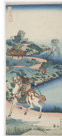
Title: The Youth's Journey (Shnenk) Date: about 1833 Primary Maker: Katsushika Hokusai Medium: woodblock print; ink and color on paper