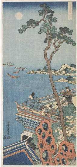
Title: Abe no Nakamaro Date: about 1833 Primary Maker: Katsushika Hokusai Medium: woodblock print; ink and color on paper