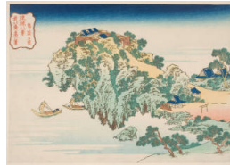
Title: Evening Glow at Jungai (Jungai sekish) Date: about 1832 Primary Maker: Katsushika Hokusai Medium: woodblock print; ink and color on paper