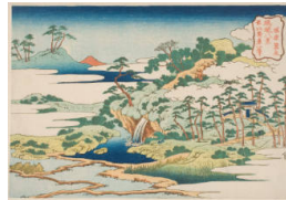
Title: The Sacred Spring at Jgaku (Jgaku reisen) Date: 1832–1833 Primary Maker: Katsushika Hokusai Medium: woodblock print; ink and color on paper