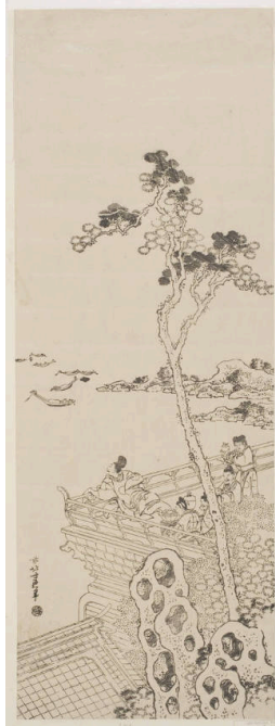
Title: Abe no Nakamaro Date: about 1833 Primary Maker: Katsushika Hokusai Medium: woodblock print; key block; ink on paper