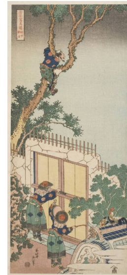
Title: Sei Shnagon Date: about 1833 Primary Maker: Katsushika Hokusai Medium: woodblock print; ink and color on paper