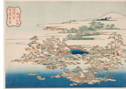
Title: Pines and Waves at Ryt (Ryt sht) Date: about 1832 Primary Maker: Katsushika Hokusai Medium: woodblock print; ink and color on paper