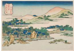
Title: Banana Garden at Nakashima (Nakashima shen) Date: about 1832 Primary Maker: Katsushika Hokusai Medium: woodblock print; ink and color on paper