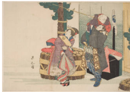
Title: Four Young "Green-House Beauties." Date: February 1776 Primary Maker: Kitao Shigemasa Medium: woodblock print