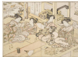
Title: Four Young Women Of Ogi-Ya Date: February 19, 1776 Primary Maker: Kitao Shigemasa Medium: woodblock print