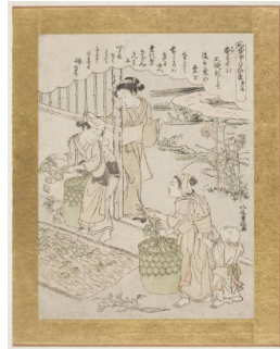
Title: Women Feeding Full-Grown Silkworms

Date: about 1772 Primary Maker: Kitao Shigemasa Medium: woodblock print