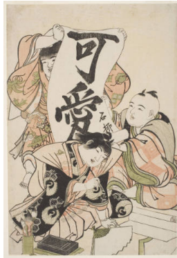
Title: The First Writing In The New Year Date: about 1780 Primary Maker: Kitao Shigemasa Medium: woodblock print