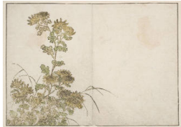
Title: Flowers Of The Winter Months: Chrysanthemums Date: February 1776 Primary Maker: Katsukawa Shunsh Medium: woodblock print