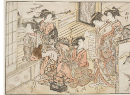
Title: Five Young Women Of Okamoto-Ya Date: February 19, 1776 Primary Maker: Kitao Shigemasa Medium: woodblock print