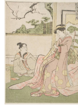
Title: A Woman Seated on a Kotatsu Date: about 1794 Primary Maker: Kitao Shigemasa Medium: woodblock print