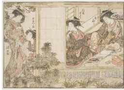
Title: Four Young Women Of O Ebi-Ya Date: February 19, 1776 Primary Maker: Katsukawa Shunsh Medium: woodblock print