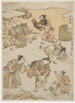
Title: Tori Shi, The Zodiac Sign Of The Cock Date: about 1778 Primary Maker: Kitao Shigemasa Medium: woodblock print