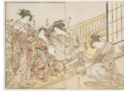
Title: Four Young Women Of Take-Ya Date: February 19, 1776 Primary Maker: Kitao Shigemasa Medium: woodblock print