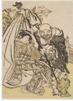
Title: The Contents Of Hotei'S Bag Date: about 1778 Primary Maker: Kitao Shigemasa Medium: woodblock print