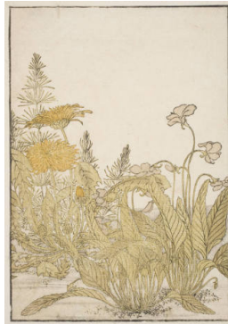
Title: Flowers of the Spring Months: Violets and Dandelions Date: February 19, 1776 Primary Maker: Kitao Shigemasa Medium: woodblock print