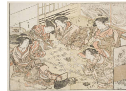
Title: Five Young Women Of Echizen-Ya Date: February 1776 Primary Maker: Katsukawa Shunsh Medium: woodblock print