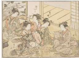
Title: Five Young Women Of Gaku Ise-Yaa Date: February 19, 1776 Primary Maker: Kitao Shigemasa Medium: woodblock print