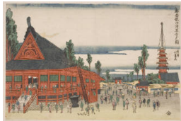
Title: Four Young Women Of Matsuba-Ya Date: February 19, 1776 Primary Maker: Kitao Shigemasa Medium: woodblock print