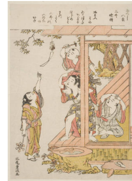
Title: The Evening Bell At Mii-Dera

Date: about 1772 Primary Maker: Kitao Shigemasa Medium: woodblock print