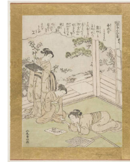
Title: The Mating Of The Butterflies

Date: about 1772 Primary Maker: Kitao Shigemasa Medium: woodblock print