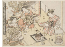
Title: Courtesans of the kaneya Date: 1776 Primary Maker: Kitao Shigemasa Medium: woodblock print; ink and color on paper