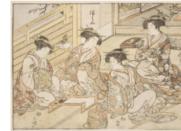
Title: Four Young Women of Matsuba-ya Date: February 19, 1776 Primary Maker: Kitao Shigemasa Medium: woodblock print