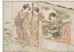
Title: Three Young Women Of Naka Omi-Ya Date: February 1776 Primary Maker: Katsukawa Shunsh Medium: woodblock print