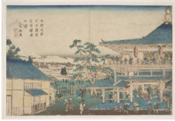
Title: Honjo Itsutsu-Me Go-Hyaku Rakan Ji Sazaedo No Zu.

Date: about 1800 Primary Maker: Kitao Shigemasa Medium: woodblock print