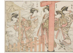
Title: Young Women of Komatsuya Date: February, 1776 Primary Maker: Kitao Shigemasa Medium: woodblock print