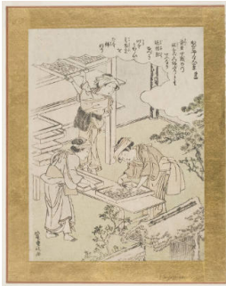
Title: Women Separating The Growing Silkworms

Date: about 1772 Primary Maker: Kitao Shigemasa Medium: woodblock print