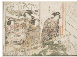
Title: Four Young Women Of Kiriboshi-Ya Date: February 1776 Primary Maker: Katsukawa Shunsh Medium: woodblock print