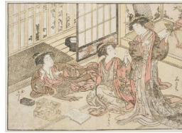
Title: Three Young Women Of Kado Daikoku-Ya Date: February 19, 1776 Primary Maker: Kitao Shigemasa Medium: woodblock print