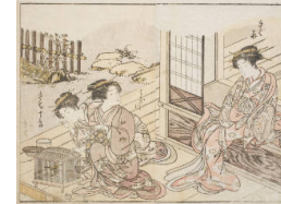
Title: Three Young Women Of Kagemanji-Ya Date: February 19, 1776 Primary Maker: Katsukawa Shunsh Medium: woodblock print