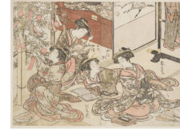
Title: Four Young Women Of Shin Kana-Ya Date: February 19, 1776 Primary Maker: Kitao Shigemasa Medium: woodblock print