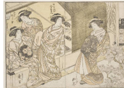
Title: Four Young "Green-House Beauties." Date: February 1776 Primary Maker: Kitao Shigemasa Medium: woodblock print