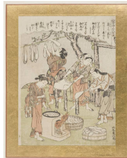
Title: Women Washing The Floss Silk

Date: about 1772 Primary Maker: Kitao Shigemasa Medium: woodblock print