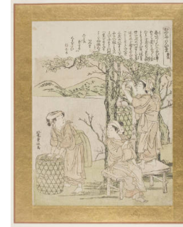
Title: Women Gathering Mulberry Leaves to Feed the Silkworms

Date: about 1800 Primary Maker: Kitao Shigemasa Medium: woodblock print