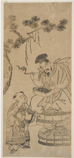
Title: Ebisu as a Fishmonger Date: about 1774 Primary Maker: Kitao Shigemasa Medium: woodblock print