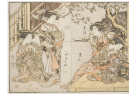
Title: Four Young Women Of Asahimaru-Ya Date: February 19, 1776 Primary Maker: Kitao Shigemasa Medium: woodblock print