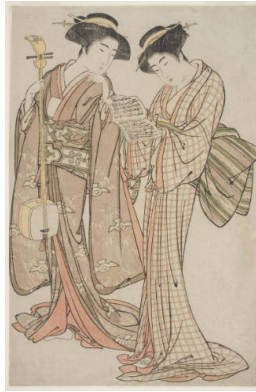
Title: Two Geisha Date: about 1778 Primary Maker: Kitao Shigemasa Medium: woodblock print