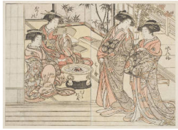
Title: Four Young Women Of O Tawara-Ya Date: February 19, 1776 Primary Maker: Katsukawa Shunsh Medium: woodblock print