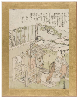
Title: Women Boiling The Cocoons And Reeling Off The Silk

Date: about 1772 Primary Maker: Kitao Shigemasa Medium: woodblock print