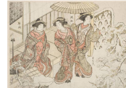
Title: Three Young Women Of Naka Omi-Ya Date: February 1776 Primary Maker: Katsukawa Shunsh Medium: woodblock print