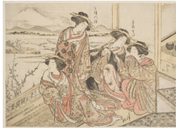
Title: Four Young Women Of O Aoi-Ya Date: February 1776 Primary Maker: Kitao Shigemasa Medium: woodblock print