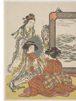
Title: Benten Holding A Large Mirror Date: about 1777 Primary Maker: Kitao Shigemasa Medium: woodblock print; ink and color on paper