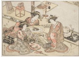
Title: Young Women of Yamashiroya Karahata and Shirado Playing Sukeroku, Matsukaze seated before a Hibachi Date: February, 1776 Primary Maker: Katsukawa Shunsh Medium: woodblock print