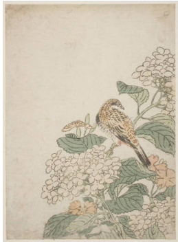
Title: Kacho: Hydrangeas, Pinks And Russett Sparros Primary Maker: Kitao Shigemasa Medium: woodblock print