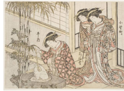
Title: Frosty Morning at Maruya Date: 1776 Primary Maker: Kitao Shigemasa Medium: Multicolored woodblock print, from an album