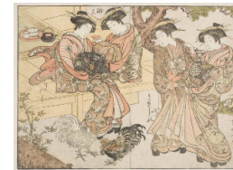
Title: Four Young Women Of Ogi-Ya Date: February 19, 1776 Primary Maker: Kitao Shigemasa Medium: woodblock print