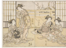
Title: Four Young Women of Kadotama-ya Date: February 19, 1776 Primary Maker: Kitao Shigemasa Medium: woodblock print