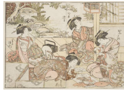
Title: Four Young Women Of O Tawara-Ya Date: February 19, 1776 Primary Maker: Katsukawa Shunsh Medium: woodblock print