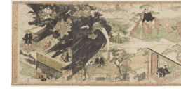
Title: Tenmangu- Go-Ichi-Daiki Date: about 1765 Primary Maker: Kitao Shigemasa Medium: woodblock print