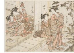
Title: Four Young Women Of Maruebi-Ya Date: February 19, 1776 Primary Maker: Kitao Shigemasa Medium: woodblock print