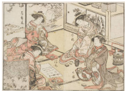
Title: Four Young Women Of Kadokane-Ya Date: February 1776 Primary Maker: Katsukawa Shunsh Medium: woodblock print