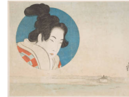
Title: Five Young "Green-House Beauties" Date: February 1776 Primary Maker: Kitao Shigemasa Medium: woodblock print