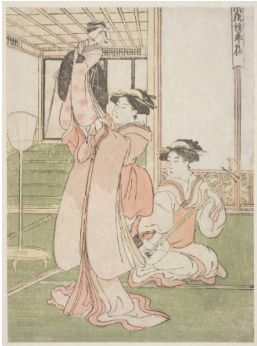
Title: A Young Woman Holding a Puppet Date: about 1794 Primary Maker: Kitao Shigemasa Medium: woodblock print