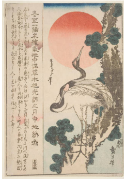
Title: Three Young Women of Matsuba-ya Date: February 19, 1776 Primary Maker: Kitao Shigemasa Medium: woodblock print