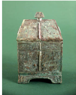
Title: Ritual Wine Container (Fang i; 'rectangular section') Date: Shang Dynasty (1600–1050 BCE) Primary Maker: Chinese Medium: bronze