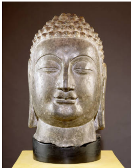
Title: Head of a Buddha Date: 550–577 Medium: Limestone