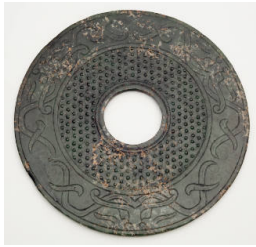
Title: Large Disk with Bands of Small Protuberances and Incised Bovine Masks Date: 3rd century BCE Primary Maker: Chinese Medium: nephrite