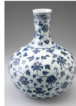
Title: Globular Vase with Stylized Peony Scroll Design (Blue-and-white ware) Date: early 15th century, Ming dynasty (1368–1644) Primary Maker: Chinese Medium: porcelain with decoration in high-iron cobalt blue pigment under a clear lime-alkali glaze