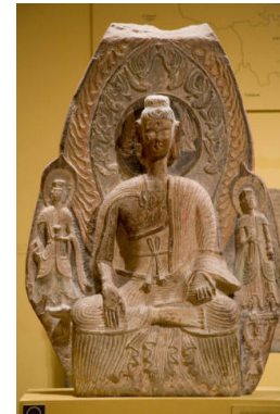
Title: Seated Buddha with Attending Bodhisattva Date: early 6th century Primary Maker: Chinese Medium: limestone with polychrome