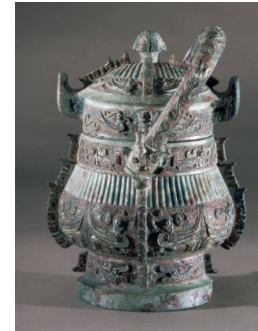
Title: Covered Ritual Wine Container (yu) Date: Shang Dynasty Primary Maker: Chinese Medium: bronze