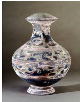
Title: HU, Ritual wine cooler Date: Han Dynasty (206 B.C.E. –220 C.E.) Primary Maker: Chinese Medium: earthenware, painted in green and red