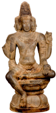
Title: Shiva as Mahesha Date: 10th century Primary Maker: Indian Medium: Granite with traces of gesso and red pigment