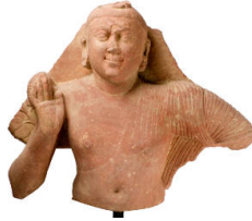
Title: Sakyamuni Buddha Date: late 1st–early 2nd century Primary Maker: Unknown Medium: mottled red sandstone