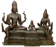
Title: Shiva with Uma and Skanda (Somaskanda) Date: 12th century Primary Maker: Unknown Medium: Bronze