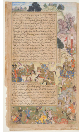
Title: A Ruler on Horseback Leading an Army Across a Battlefield from the Tarikh-i Alfi (The History of One Thousand Years) Date: about 1592-1594 Primary Maker: Indian Medium: watercolor, ink, and gold metallic paint on paper