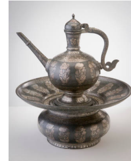
Title: Ewer and Basin with Circular Grill Date: 18th century Primary Maker: Indian (Deccan) Medium: Bidri ware (cast metal alloy of zinc, copper, and lead with silver inlay)