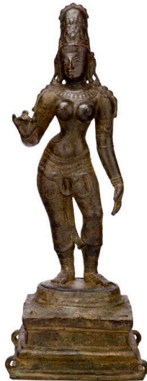
Title: The Earth Goddess Parvati, Consort of Shiva Date: Chola Dynasty, 1100–1200s Primary Maker: South Indian Medium: bronze