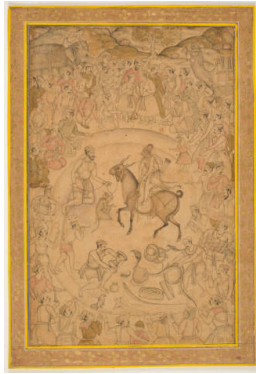
Title: Performers and Animals at an Impromptu Circus in the Countryside Date: about 1590 Primary Maker: Mughal Medium: ink, watercolor, and gold on paper