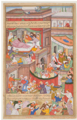
Title: "Birth of Ghazan Khan", folio from a copy of the Jami' al-tawarikh (Compendium of Chronicles) by Rashid al-Din (1247–1318) Date: about 1596 Primary Maker: Basawan Medium: Opaque watercolor, ink, and gold on paper