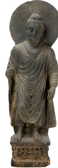
Title: Standing Shakyamuni Buddha Date: 3rd century CE Primary Maker: Gandhara Medium: argillite, with traces of gesso