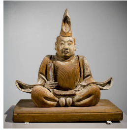
Title: Seated Shinto Shrine Figure Date: Edo period, 17th c.-early 18th c. Primary Maker: Japanese Medium: Wood, originally polychromed