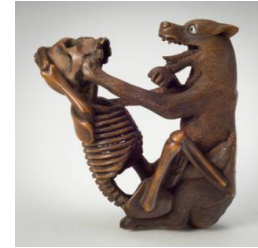
Title: Skeleton and Wolf fighting Date: 1840–1875 Primary Maker: Unknown Medium: wood with bone and horn inlay