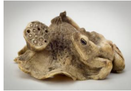
Title: Frog on Lotus Date: 1800s Primary Maker: Unknown Medium: bone