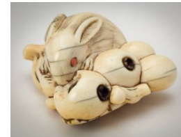
Title: Rabbit on Loquats Date: 1750–1800 Primary Maker: Unknown Medium: ivory with wood and coral inlay; Kyoto style