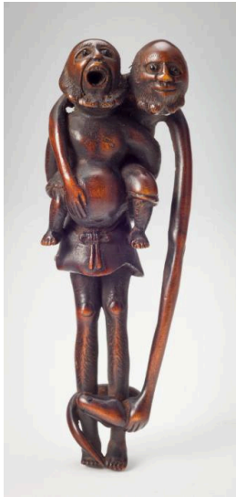
Title: Ashinaga and Tenaga Date: 1840–1875 Primary Maker: Unknown Medium: wood with horn inlay