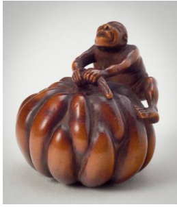
Title: Farmer with a Pumpkin Date: 1850–1900 Primary Maker: Unknown Medium: boxwood