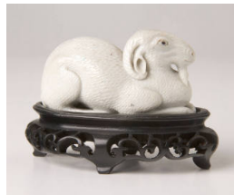
Title: Reclining Sheep Figurine (with wooden stand) Date: 19th century Primary Maker: Japanese Medium: porcelain