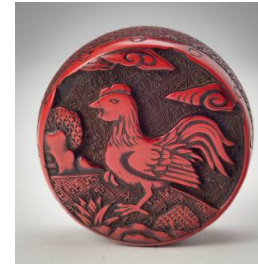
Title: Drum with Rooster and Wasps Date: 1850–1875 Primary Maker: Unknown Medium: cinnabar