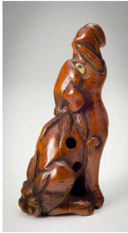
Title: Baku Howling Date: 1800–1850 Primary Maker: Unknown Medium: wood with ivory and horn inlay