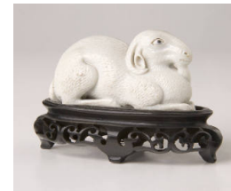
Title: Reclining Sheep Figurine (with wooden stand) Date: 19th century Primary Maker: Japanese Medium: porcelain