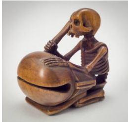
Title: Skeleton Beating Drum Date: 1850–1900 Primary Maker: Unknown Medium: wood