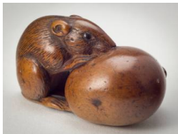
Title: Rat on an Eggplant Date: 1840–1875 Primary Maker: Unknown Medium: wood