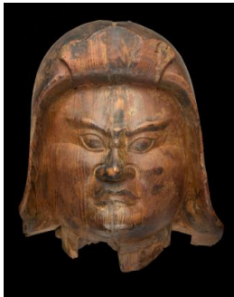
Title: Head of a Buddhist Guardian Date: Heian period, second half of the 11th century Primary Maker: Japanese Medium: joined woodblock construction (yosegi zukuri) with traces of polychrome and gold