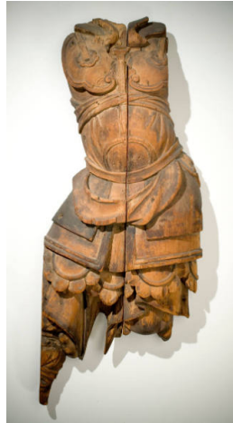
Title: Torso of a Guardian of the Buddhist Faith Date: Kamakura period (1185–1333) Primary Maker: Japanese Medium: cypress wood (hinoki) with some original polychrome and gesso