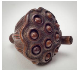
Title: Lotus Pod Date: 1850–1900 Primary Maker: Unknown Medium: wood