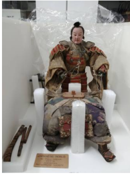
Title: Seated Doll of a Samurai in Full Ceremonial Garb Date: late 1800s Primary Maker: Japanese Medium: metal, wood, bisque, silk, and other textiles