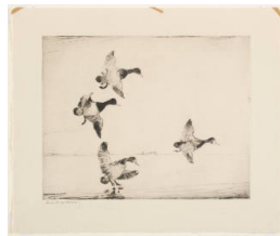
Title: Untitled (Four Mallards Landing) Date: 1930s Primary Maker: Frank Weston Benson Medium: etching on paper