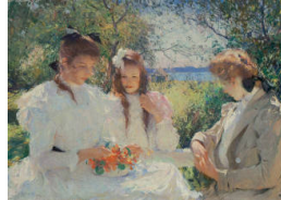
Title: Portrait of My Daughters Date: 1907 Primary Maker: Frank Weston Benson Medium: oil on canvas