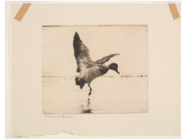
Title: Untitled (Mallard Landing) Date: 1930s Primary Maker: Frank Weston Benson Medium: etching on paper