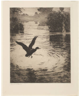
Title: Untitled (Mallard Landing) Date: 1930s Primary Maker: Frank Weston Benson Medium: etching on paper