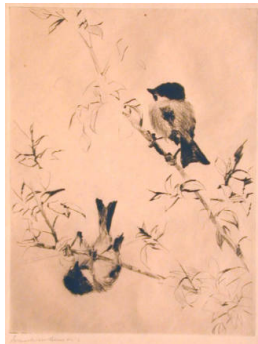
Title: Chickadees Date: 1919 Primary Maker: Frank Weston Benson Medium: drypoint on cream wove paper