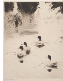
Title: Broadbills Date: 1919 Primary Maker: Frank Weston Benson Medium: drypoint on cream wove paper