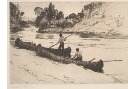
Title: On the Kedgwick Date: 1923 Primary Maker: Frank Weston Benson Medium: etching and drypoint on cream laid paper