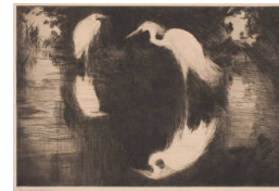
Title: Dark Pool Date: 1920 Primary Maker: Frank Weston Benson Medium: etching and drypoint