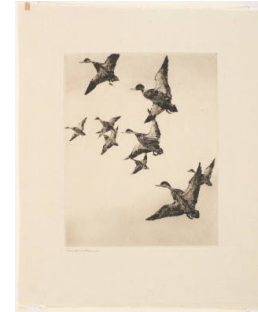
Title: Untitled (Nine Mallards in Flight) Date: 1930s Primary Maker: Frank Weston Benson Medium: etching on paper