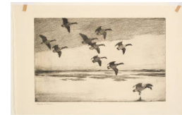
Title: Untitled (Ten Geese) Date: 1930s Primary Maker: Frank Weston Benson Medium: etching on paper