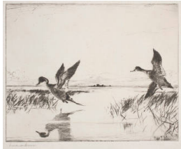
Title: Pair of Pintails Date: 1930 Primary Maker: Frank Weston Benson Medium: drypoint on cream wove paper, ed. of 150