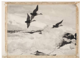
Title: Eider Ducks Flying Date: about 1913 Primary Maker: Frank Weston Benson Medium: watercolor over graphite on off-white wove paper