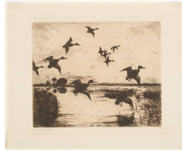
Title: Untitled (Eleven Ducks in Flight over March) Date: 1930s Primary Maker: Frank Weston Benson Medium: etching on paper