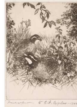
Title: Quail Date: 1944 Primary Maker: Frank Weston Benson Medium: etching and drypoint on cream laid paper