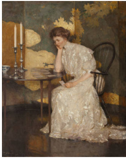
Title: Girl Playing Solitaire Date: 1909 Primary Maker: Frank Weston Benson Medium: oil on canvas