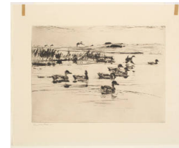
Title: Untitled (Group of Ducks in Marsh with Three Flying) Date: 1930s Primary Maker: Frank Weston Benson Medium: etching on paper