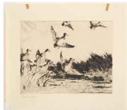
Title: Untitled (Seven Mallards Taking Off From Marsh) Date: 1930s Primary Maker: Frank Weston Benson Medium: etching on paper