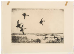
Title: Untitled (Five Mallards in Marsh, Four Landing) Date: 1930s Primary Maker: Frank Weston Benson Medium: etching on paper