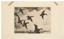
Title: Untitled (Nine Mallards in Flight One Half Visible) Date: 1930s Primary Maker: Frank Weston Benson Medium: etching on paper