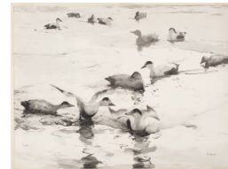
Title: Eider Ducks in Winter Date: about 1913 Primary Maker: Frank Weston Benson Medium: watercolor, gouache, and lead white additions over graphite on off-white wove paper