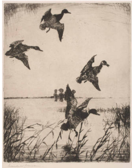
Title: Sunset at Long Point Date: 1933 Primary Maker: Frank Weston Benson Medium: etching and drypoint on cream wove paper