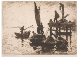
Title: Boats at Dawn Date: 1920 Primary Maker: Frank Weston Benson Medium: etching