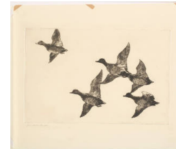
Title: Untitled (Five Mallards in Flight) Date: 1930s Primary Maker: Frank Weston Benson Medium: etching on paper