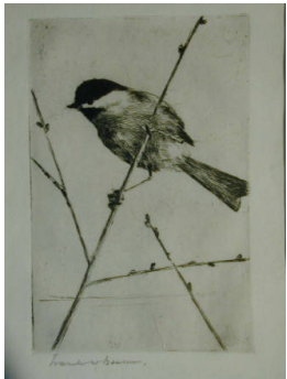
Title: Chickadee Date: 1930 Primary Maker: Frank Weston Benson Medium: drypoint on cream laid paper