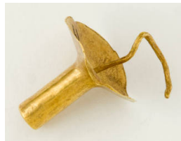
Title: Earring Date: n.d. Primary Maker: Colombia Medium: gold and silver alloy