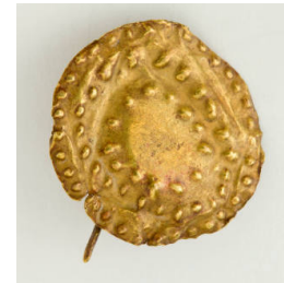
Title: Earring Date: n.d. Primary Maker: Colombia Medium: gold and possibly silver alloy