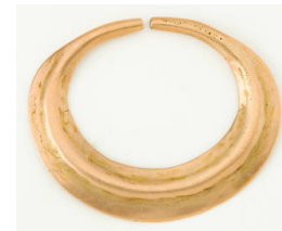
Title: Nose ornament Date: n.d. Primary Maker: Colombia Medium: gold and copper alloy