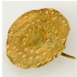
Title: Earring Date: n.d. Primary Maker: Colombia Medium: gold and silver alloy