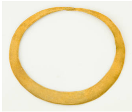
Title: Bangle Date: n.d. Primary Maker: Colombia Medium: gold and silver alloy