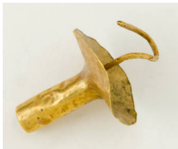
Title: Earring Date: n.d. Primary Maker: Colombia Medium: gold and silver alloy