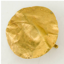
Title: Earring Date: n.d. Primary Maker: Colombia Medium: gold and possibly silver alloy