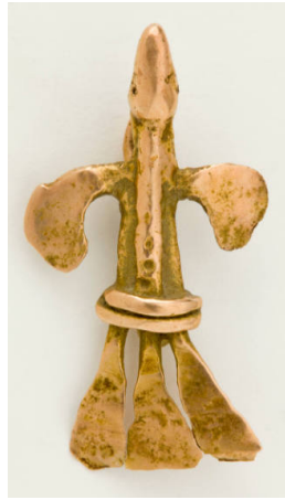
Title: Bird pendant Date: n.d. Primary Maker: Popayán Medium: gold and copper alloy