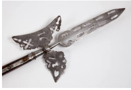
Title: Halberd for an officer of the Trained Band Date: 1678 Medium: steel, wood (probably maple)