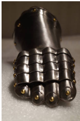
Title: Right Gauntlet Date: 1550–60 Primary Maker: Southern German Medium: steel, iron, brass and leather