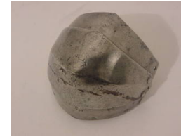
Title: Cowter (elbow guard) Date: 1400s Primary Maker: Italian Medium: steel