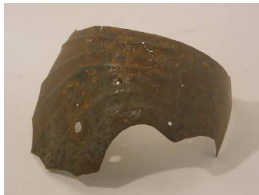
Title: Mainplate of a Right Pauldron (shoulder guard) Date: late 1400s Primary Maker: German Medium: steel