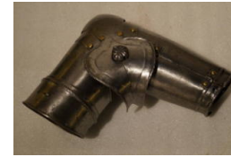
Title: Left Vambrace Date: 1570–1575 Primary Maker: Southern German Medium: steel, iron, brass and leather