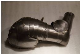
Title: Right Vambrace Date: 1570–1575 Primary Maker: Southern German Medium: steel, iron, brass and leather