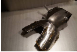
Title: Lance Rest Date: about 1925 Primary Maker: Southern German Medium: steel