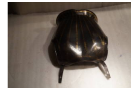
Title: Backplate Date: possibly 1575–1580, reworked in the 1800s Primary Maker: Italian Medium: Steel with later engraving, gilding, and blueing; brass; leather; modern restorations