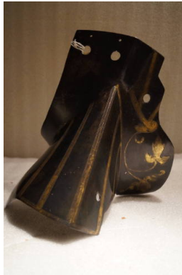
Title: Grandguard (upper part) Date: 1575–1580, reworked in the 1800s Primary Maker: Italian Medium: Steel with later engraving, gilding, and blueing