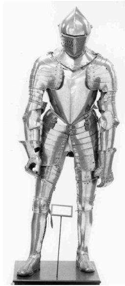
Title: Composite Armor Date: 1550–1600, with 19th century restorations Primary Maker: Austrian Medium: steel, iron, brass and copper with leather