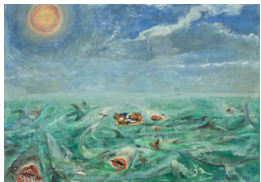
Title: The Rubber Raft Date: about 1945 Primary Maker: Philip Evergood Medium: oil on board