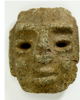
Title: Stone Mask Date: 300 BCE - 100 BCE Primary Maker: Mezcala Medium: stone