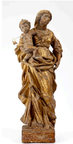
Title: Madonna and Child Date: 1600s Primary Maker: Italian Medium: gilded wood