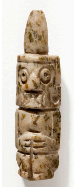
Title: Figure Date: n.d. Primary Maker: Pre-Columbian Medium: stone