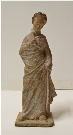
Title: Tanagra Maiden Date: 450–200 BCE Primary Maker: Greek Medium: painted or glazed terracotta