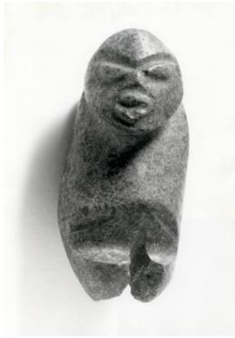
Title: Figurine Date: 500 BCE–500 CE Primary Maker: Mezcala Medium: stone