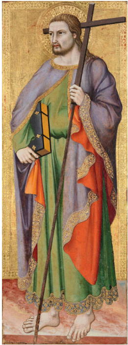
Title: Saint Philip Date: about 1335 Primary Maker: Master of Figline Medium: egg tempera and gold leaf on panel