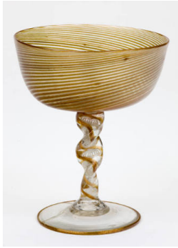
Title: Wine cup Date: 16th century–18th century Primary Maker: Venetian Medium: glass