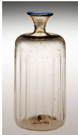
Title: Bottle Date: 1500s–1700s Primary Maker: Venetian Medium: glass