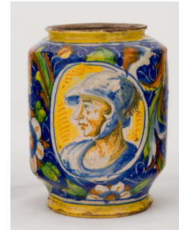
Title: Drug Jar (Albarello) Date: 1550–1600 Medium: maiolica; tin-glazed earthenware