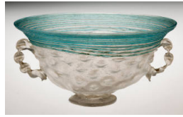
Title: Cup Date: 1500s–1700s Primary Maker: Venetian Medium: glass