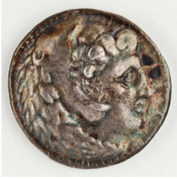
Title: Philip III, Tetradrachm from the mint of Susa Date: 323–316 BCE Primary Maker: Greek Medium: silver