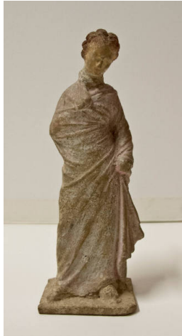
Title: Tanagra Maiden Date: 450–200 BCE Primary Maker: Greek Medium: painted or glazed terracotta