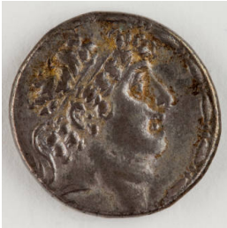
Title: Philip Philadelphus Date: 92–83 BCE Primary Maker: Greek Medium: silver