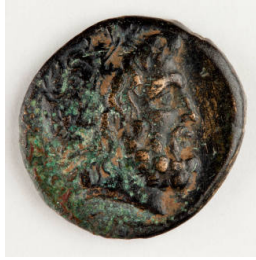
Title: Philip V, Stater Date: 200–179 BCE Primary Maker: Greek Medium: bronze