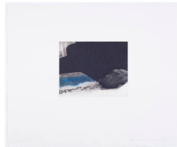
Title: Untitled (Plate 6) Date: 1982 Primary Maker: John Baldessari Medium: drypoint, aquatint, soft ground sugarlift and photoetching