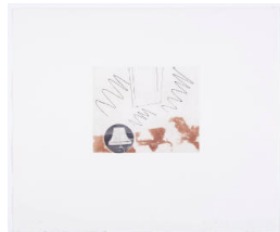
Title: Untitled (Plate 8) Date: 1982 Primary Maker: John Baldessari Medium: drypoint, aquatint, soft ground sugarlift and photoetching