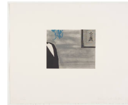
Title: Untitled (Plate 9) Date: 1982 Primary Maker: John Baldessari Medium: drypoint, aquatint, soft ground sugarlift and photoetching