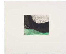
Title: Untitled (Plate 7) Date: 1982 Primary Maker: John Baldessari Medium: drypoint, aquatint, soft ground sugarlift and photoetching