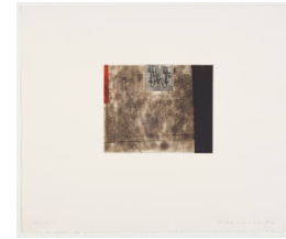
Title: Untitled (Plate 3) Date: 1982 Primary Maker: John Baldessari Medium: drypoint, aquatint, soft ground sugarlift and photoetching