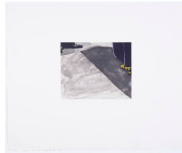
Title: Untitled (Plate 2) Date: 1982 Primary Maker: John Baldessari Medium: drypoint, aquatint, soft ground sugarlift and photoetching