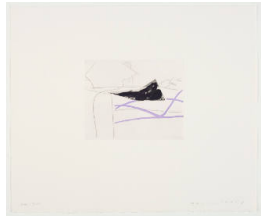
Title: Untitled (Plate 1) Date: 1982 Primary Maker: John Baldessari Medium: drypoint, aquatint, soft ground sugarlift and photoetching