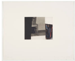
Title: Untitled (Plate 4) Date: 1982 Primary Maker: John Baldessari Medium: drypoint, aquatint, soft ground sugarlift and photoetching