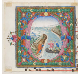
Title: Fragment of a Leaf from an Antiphonal Date: 15th century Primary Maker: Italian Medium: tempera and gold leaf on vellum