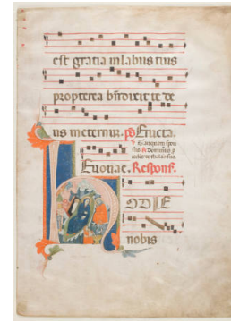
Title: Double Leaf from an Antiphonal Date: 1300s Primary Maker: Italian Medium: ink and water-based paint on parchment