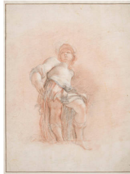
Title: Figure of a Woman in Classical Armor Date: 17th century - 18th Century Primary Maker: Italian Medium: black and red chalk over graphite, with white heightening on cream wove paper