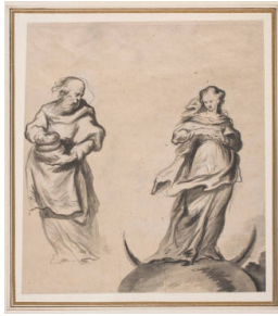
Title: Virgin on a Crescent Moon and a Monk with Loaves Date: 18th Century Primary Maker: Genoan Medium: black ink and wash with white heightening on cream laid paper