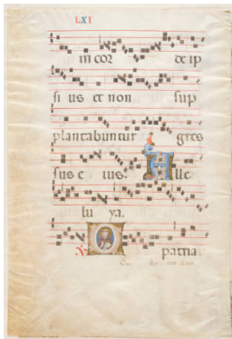
Title: Double Leaf from a Gradual Date: about 1325 Primary Maker: Italian Medium: ink, tempera and gold leaf on vellum