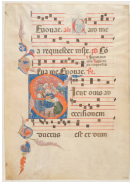
Title: Leaf from an Antiphonal Date: 14th century Primary Maker: Italian Medium: ink and tempera on vellum