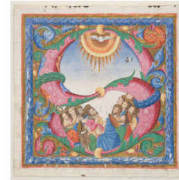
Title: Fragment of a Leaf from an Antiphonal Date: 15th century Primary Maker: Italian Medium: tempera and gold leaf on vellum