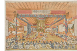
Title: Perspective Picture of the Great Kagura Ceremony at Ise