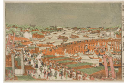
Title: Perspective Picture of Cooling-Off in the Evening at Ryogoku