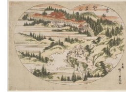
Title: Kyoto Atagoyama