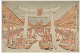
Title: Picture of Benzaiten Festival at Itsukushima in the Autumn