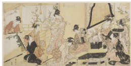
Title: Preparation for the Jomi Festival Date: about 1799 Primary Maker: Utagawa Toyohiro Medium: woodblock print