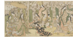
Title: Picture Of The Pleasures Of The Taiko And His Five Wives At Rakuto Date: about 1804 Primary Maker: Kitagawa Utamaro I Medium: woodblock print