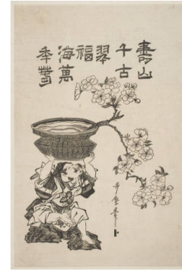
Title: A Fanciful Flower Arrangement Date: about 1790 Primary Maker: Kitagawa Utamaro I Medium: woodblock print