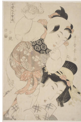
Title: Holding Two Mirrors Date: about 1807 Primary Maker: Kitagawa Utamaro II Medium: woodblock print