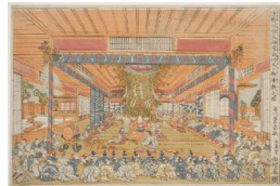
Title: Perspective Picture of the Great Kagura Ceremony at Ise Date: about 1773 Primary Maker: Utagawa Toyoharu Medium: woodblock print