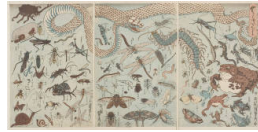
Title: Reptiles And Insects Date: about 1850 Primary Maker: Utagawa Sadahide Medium: woodblock print