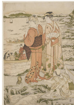
Title: The Outing At Seven-Ri Beach Date: about 1788 Primary Maker: Kitagawa Utamaro I Medium: woodblock print