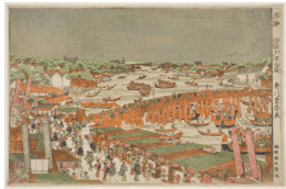
Title: Perspective Picture of Cooling-Off in the Evening at Ryogoku Date: about 1773 Primary Maker: Utagawa Toyoharu Medium: woodblock print