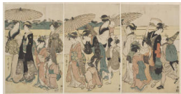
Title: Procession of Women and Children Date: about 1795 Primary Maker: Kitagawa Utamaro I Medium: woodblock print