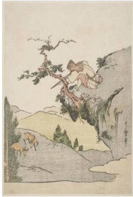
Title: The Deer Hunter Date: about 1790 Primary Maker: Kitagawa Utamaro I Medium: woodblock print