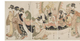
Title: Fanciful Children's Treasure Ship Date: Ki-no-to ushi saitan, Jan 31, 1805 Primary Maker: Kitagawa Utamaro I Medium: woodblock print