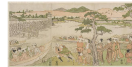
Title: Picture of a Visit to Yawata on the Bank of the Yodo River Date: about 1788 Primary Maker: Katsukawa Shunzan Medium: woodblock print