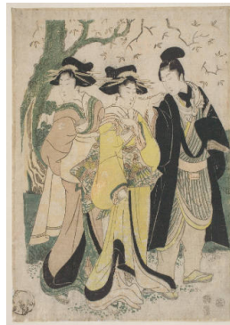
Title: A Wakashu and Two Young Women under Cherry Trees on a Flower Viewing Excursion Date: 11th mont Bunka 3, December 1806 Primary Maker: Kikukawa Eizan Medium: woodblock print