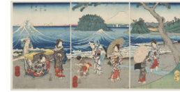
Title: Picture of a Visit to Enoshima in Soshu Date: 4th month ox year, 1853 Primary Maker: Utagawa Hiroshige II (Shigenobu) Medium: woodblock print