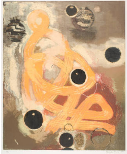
Title: Circles, Smoke and Braid Date: 1990 Primary Maker: Christopher Brown Medium: color woodcut on white wove paper