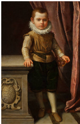
Title: Portrait of a Young Boy of the Visconti-Borromeo Family Date: late 1500s Primary Maker: Italian Medium: oil on canvas