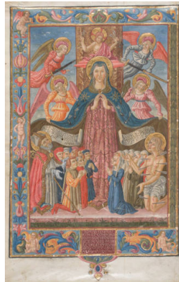
Title: Leaf with a Full-Page Illumination: St. Mary of Mercy Date: about 1480-1525 Primary Maker: Italian Medium: ink, tempera and gold leaf on vellum