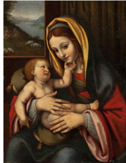
Title: The Virgin and Child Date: 15th century Primary Maker: Italian Medium: tempera on copper panel