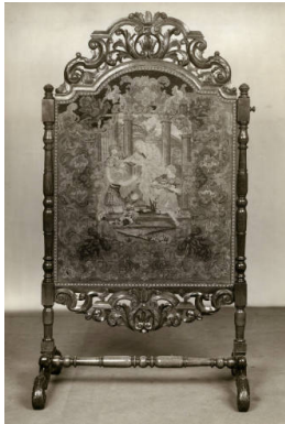
Title: Firescreen with Standard: Christ Healing the Blind Date: about 1685 Primary Maker: Louis XIV style Medium: walnut with wool embroidery