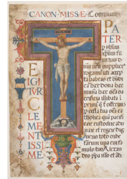
Title: Leaf from a Missal, Beginning of the Canon of the Mass Date: dated 1501, likely early 20th century Primary Maker: Italian Medium: tempera and gold leaf on vellum