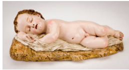
Title: Sleeping Christ Child Date: late 1700s Primary Maker: Caspicara Medium: painted wood