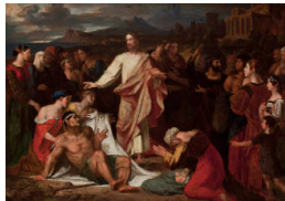
Title: Christ Healing the Sick Date: 1813 Primary Maker: Washington Allston Medium: oil on laminated millboard