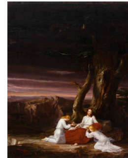
Title: Angels Ministering to Christ in the Wilderness Date: 1843 Primary Maker: Thomas Cole Medium: oil on linen