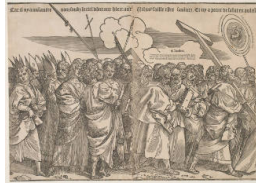
Title: Apostles I Date: about 1511 Primary Maker: Italian Medium: woodcut on cream laid paper