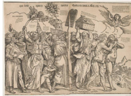
Title: Prophets I Date: about 1511 Primary Maker: Italian Medium: woodcut on cream laid paper