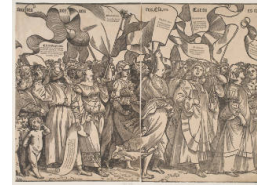
Title: Prophets II Date: about 1511 Primary Maker: Italian Medium: woodcut on cream laid paper