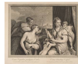
Title: Venus blinding Cupid Date: 1769 Primary Maker: Robert Strange Medium: line engraving on cream laid paper