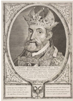
Title: Carolus Austraiacus Date: 1650 Primary Maker: Cornelis de Visscher Medium: etching and engraving on cream laid paper