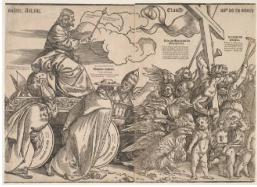
Title: The Chariot of Christ Date: about 1511 Primary Maker: Italian Medium: woodcut on cream laid paper