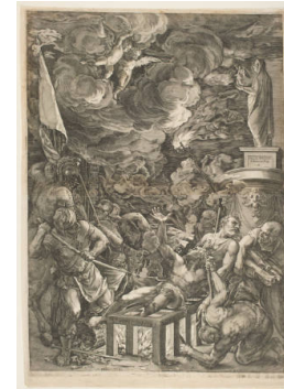
Title: The Martyrdom of St. Lawrence Date: 1571 Primary Maker: Cornelis Cort Medium: engraving on cream laid paper