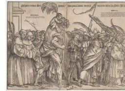
Title: Confessors Date: about 1511 Primary Maker: Italian Medium: woodcut on cream laid paper