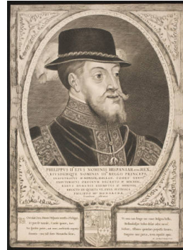
Title: Phillippus II Date: 1650 Primary Maker: Cornelis de Visscher Medium: etching and engraving on cream laid paper