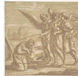
Title: Three Angels appearing to Abraham Date: second half of the 18th century - early 19th century Primary Maker: John Skippe Medium: chiaroscuro woodcut