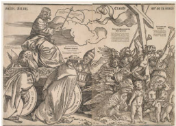
Title: Trumpets Date: about 1511 Primary Maker: Italian Medium: woodcut on cream laid paper