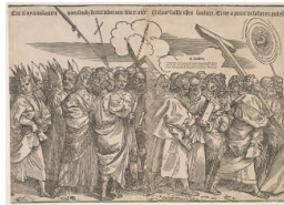
Title: Apostles II Date: about 1511 Primary Maker: Italian Medium: woodcut on cream laid paper