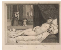
Title: Venus Date: 1768 Primary Maker: Robert Strange Medium: engraving on cream laid paper