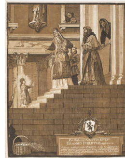
Title: Presentation of the Virgin Date: 1742 Primary Maker: John Baptist Jackson Medium: chiaroscuro, four blocks (one of three sheets) on cream laid paper