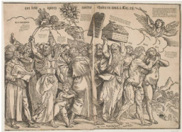
Title: Adam and Eve Date: about 1511 Primary Maker: Italian Medium: woodcut on cream laid paper